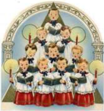
Heralding the Good News Advent Devotionals 2019