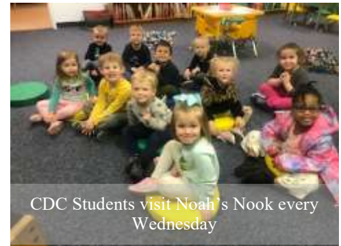
CDC Students visit Noah's Nook every Wednesday