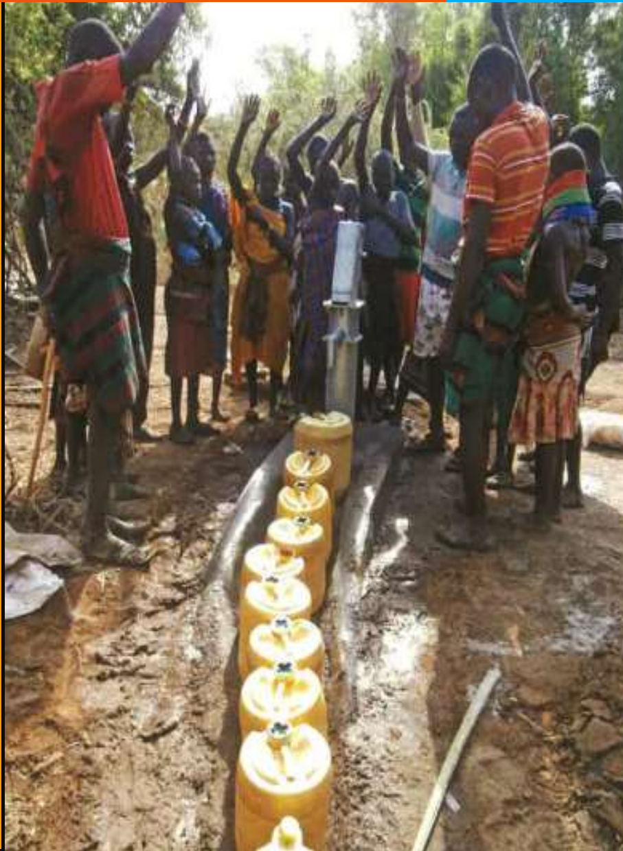
Photo of the Kokel water well drilled in 2019.