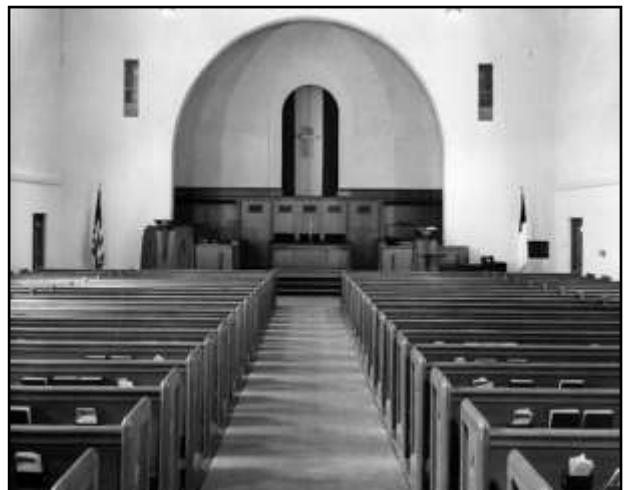
First Christian Church Chancel, 1948

In our original sanctuary, two soaring arches reflecting the Spanish mission architecture of the church graced the chancel. The pulpit and lectern were just outside of the large outer arch that sheltered the Communion Table and choir. The high inner arch housed the baptistery and could be lit from within. During renovation, these elements were moved to their current home in front of our stained glass windows, the sanctuary was enlarged, and the balcony was added. Today's sanctuary may look quite different, but when you gaze up at our vaulted ceiling with its exposed beams and spectacular pendant lights, walk down our cloistered side aisles, or sit in our carved pews, you are seeing its original history.